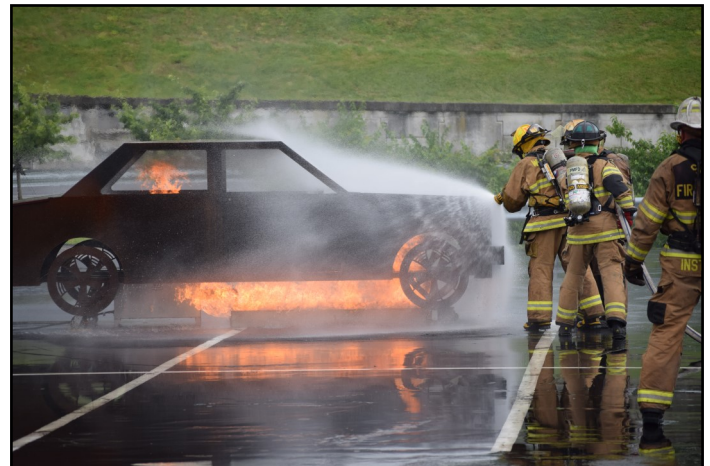
ABOVE: Firefighters had the opportunity for hand's on training during State Fire School.