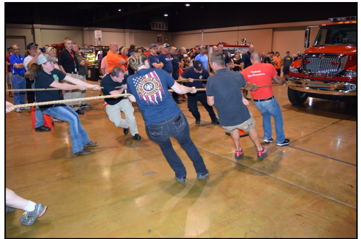
ABOVE: Several fire departments participated in the first annual Fire Truck Pull at State Fire School.

An AIL representative will contact members who return the reply card to arrange a convenient time to deliver their benefits and review other supplemental insurance benefits that may be available.