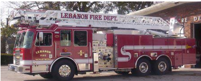
Lebanon Fire Department KME 100' Rear Mount Aerial

KME Fire Apparatus is a leading manufacturer of both custom and commercial apparatus. For more information, please call Fire Department Service & Supply, Louisville. 1-800-321-6965