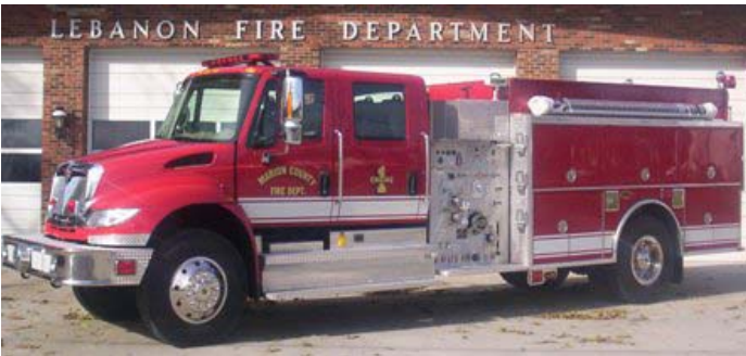
Marion Co. Fire Department KME / International Pumper