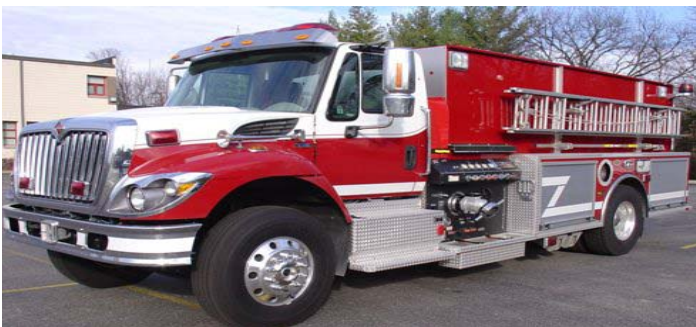
Franklin-Simpson Fire Department 2000 Gallon KME Eliminator Tanker