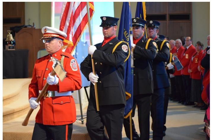
ABOVE: Members of the Honor Guard at the 2015 KFA Memorial.