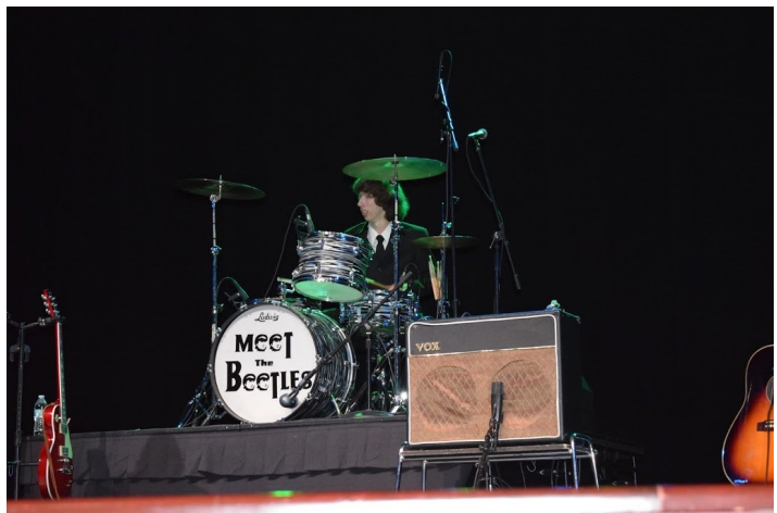
ABOVE: Meet the Beetles concert during the 2015 KFA Conference. KFA members had a great time, see more photos at www.kyfa.org