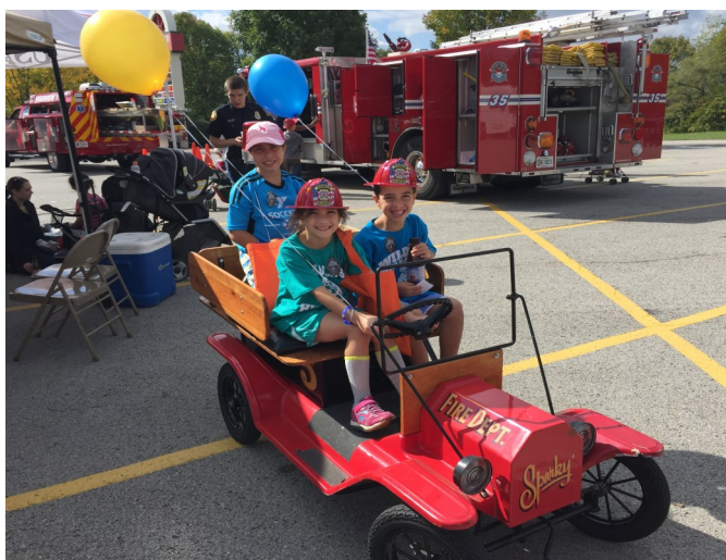
ABOVE: These youngsters enjoyed learning about fire prevention during the Highview Community Festival.