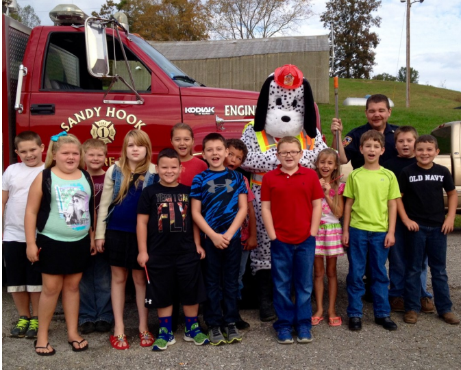
ABOVE: Sandy Hook Volunteer Fire & Rescue teaching fire prevention at Sandy Hook K-6.

AROUND KENTUCKY - Fire Prevention Week was in full swing around the Commonwealth the week of October 4-10. This year the KFA is putting a spotlight on communities around the Commonwealth that shared their photos and stories of fire prevention week.