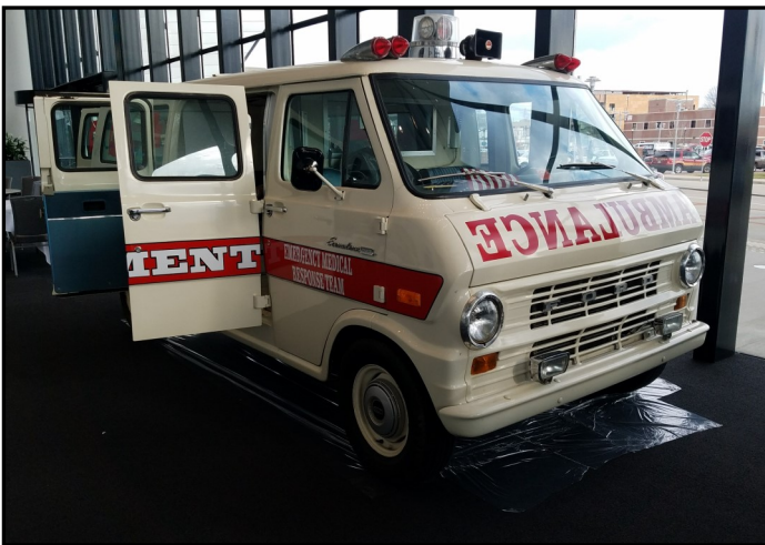
ABOVE: The East Marshall Fire District's 70's style ambulance on display at Bryant Stiles Officers School.