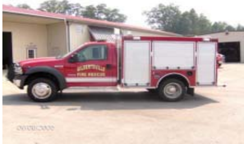
Gilbertsville Fire Department