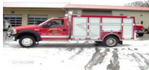
Fairdealing-Olive Fire Department