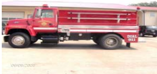
North Magoffin Fire Department