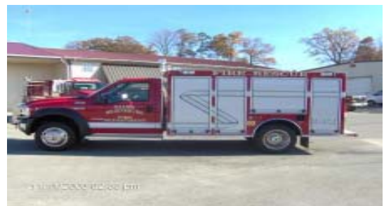
Palma-Briensburg Fire Department