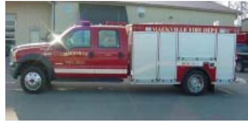
Mackville Fire Department