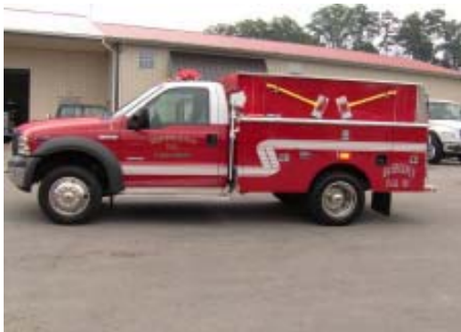
Richland Volunteer Fire Department