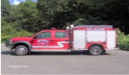
Jake's Branch Fire Department

The Wynn Fire & Rescue Equipment Company is pleased to announce the delivery of the following apparatus to these Kentucky Fire Departments.