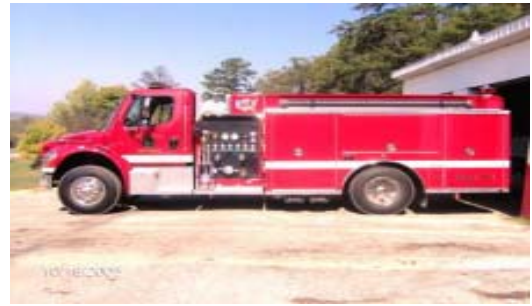
Dunnville Fire Department