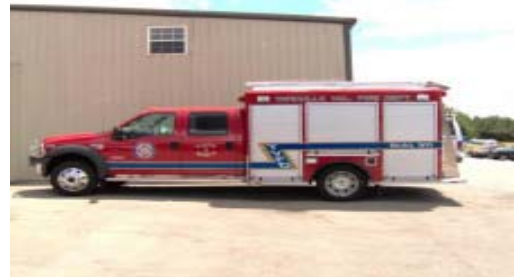
Tateville Fire Department