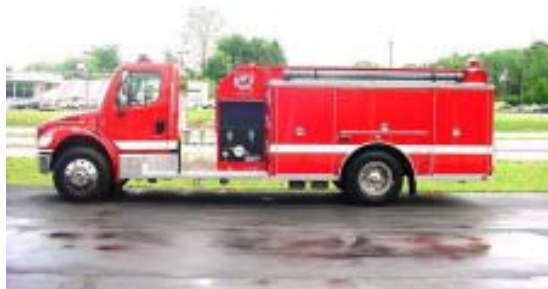
Viola Fire Department