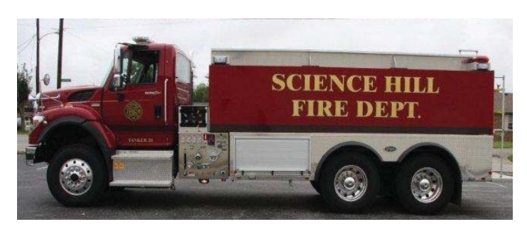
Science Hill has taken delivery on a 750 GPM-3000 gal. Tank Aluminum Body

Three Departments in Pulaski Co Kentucky have taken delivery of three Toyne Apparatus sold by High Tech Rescue , Inc . in Shelbyville.