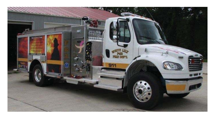
White Lilly-1250 GPM-1000 gal. Tank Class A foam System. Stainless Body.