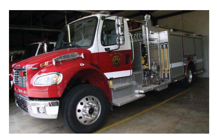
Mt. Victory- 1250 GPM-1000 gal. Tank Class A foam System. Stainless Body.