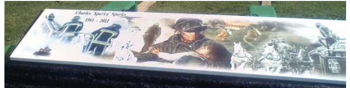
Above is pictured Sparky's vault lid.