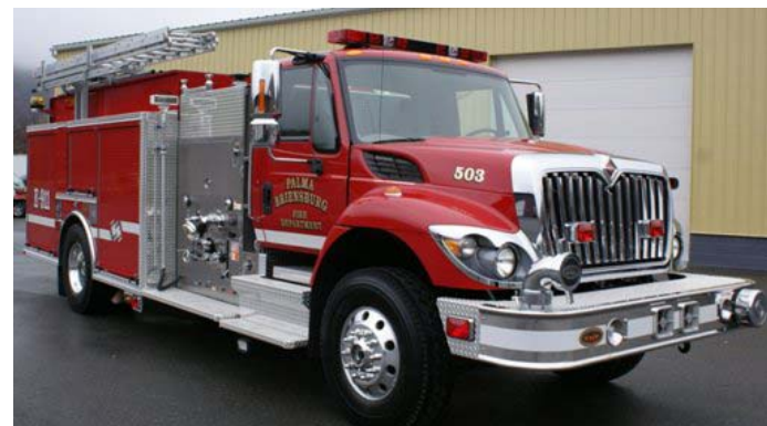
Palma-Briensburg Fire Department: KME / International pumper.

Fire Department Service & Supply Co. along with KME Fire Apparatus would like thank the following departments for their recent purchase of new KME apparatus.