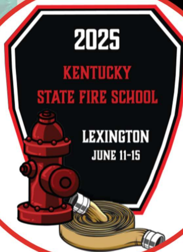
EXHIBIT SHOWCASE 2025