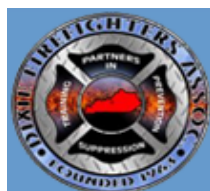
Dixie Firefighters Association

The Dixie Firefighters Association is excited about the success of our 2013 Dixie Fire School. The entire weekend was one full of learning, education and fellowship. With 48 of the 50 planned classes being held, the students received a wide variety of training opportunities. The Dixie School had 781 students register for classes. This was the independent student count and represented the total number of individual students who participated. Add to this number, approximately 50 instructors and another 50 school staff, the 2013 Dixie School was a huge success.