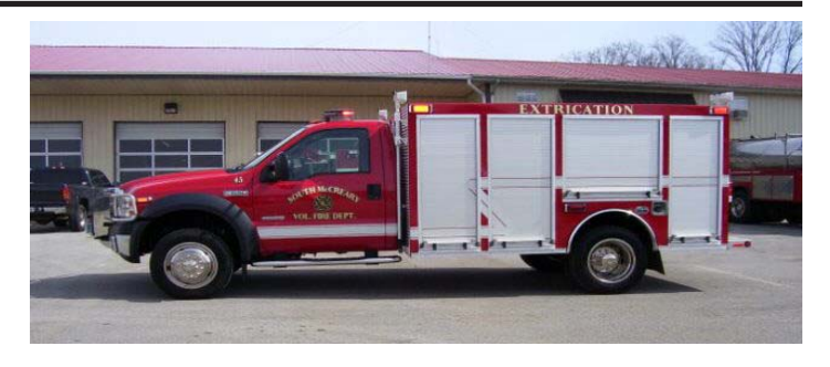
South McCreary- 2006 Ford F-550 Rescue, 6.0 Litre Diesel Engine, 11 Custom Built Aluminum Rescue Body.