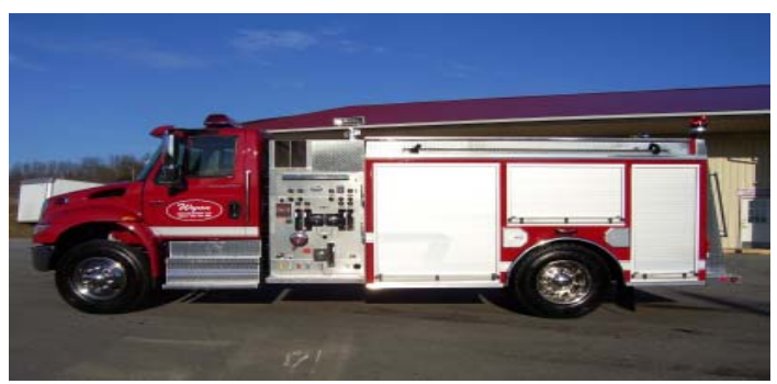
Hatfield- 2007 International Pumper, DT570 Engine, 1250-gpm Darley Pump, and a 1000-gallon Poly Tank.