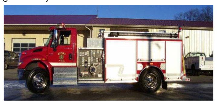
Evona- 2006 International Pumper, Waterous Pump Module with Foam Package, and a 1250-gallon Poly Tank.