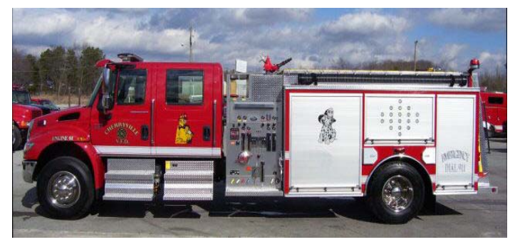
Cherryville FD- 2007 International Pumper, DT570 Engine, 1250-gpm Darley Side Mount Pump, and 1250-gallon Poly Tank.