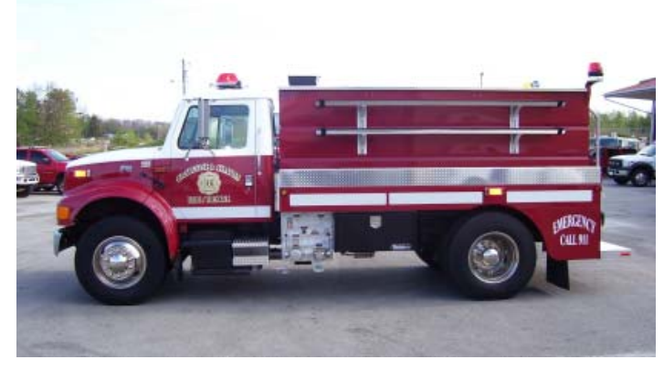
Grapevine/Chavies- 1995 International Tanker, DT466 Engine, 400-gpm Gorman Rupp Pump, and an 1800-gallon Poly Tank.