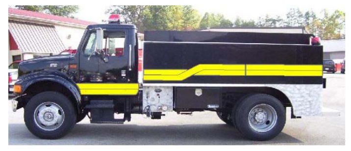
North Pendleton- 1996 International Tanker, DT466 Engine, 400-gpm Gorman Rupp Pump, and 2000-gallon Poly Tank.